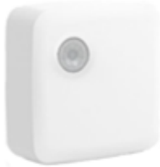
Motion & Temperature